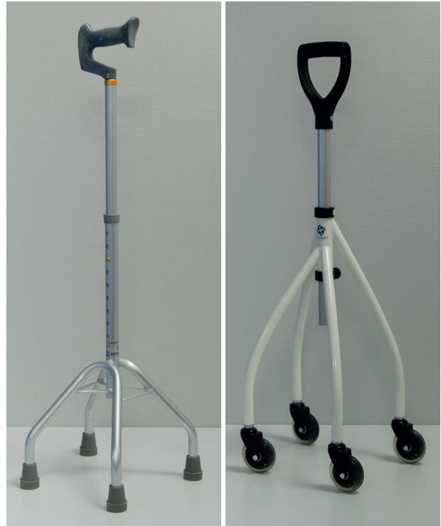
Fig. 2 Quadripod cane.

All of the participants benefited from a short (few minutes) training session performed by the physical therapist involved in the study to familiarize themselves with the rolling cane. The rolling cane Wheelleo® is a new device. It weighs 2.7 kg and the height can be adapted from 74 to 98 cm. Before starting the experiment, the global neurological impairments were assessed using the Stroke Impairment Assessment Set (SIAS) (9). The resting heart rate (RHR), in beats per min (bpm), and the presence of beta-blocker medication were also monitored. During each session (with the quadripod cane (Fig. 2) or rolling cane (Fig. 3)),